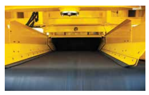
HIGH PRODUCTION. Smooth, 63" (160 cm) belt enables high-volume product removal and is constructed of .5" thick (12.7 mm) rubber belt to help resist tearing and puncturing.