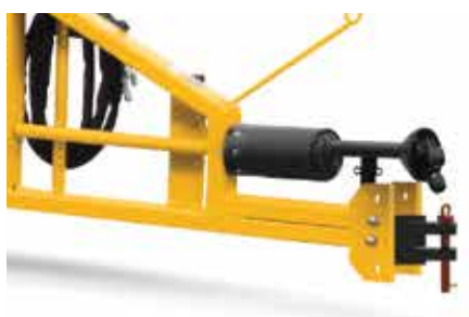
CONVENIENT TOWING. An optional low-speed transport kit makes converting between work and transport modes quicker and easier using tow-tractor hydraulics and simple hand tools.