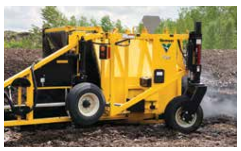
HEAVY-DUTY FRAME. Constructed of four members of 4" x 3" x 3/16" (10.2 cm x 7.6 cm x .5 cm) structural steel tubing and steel plate. Heavy-duty frame adds rigidity to the unit to help prolong the life of bearings and drum shafts.